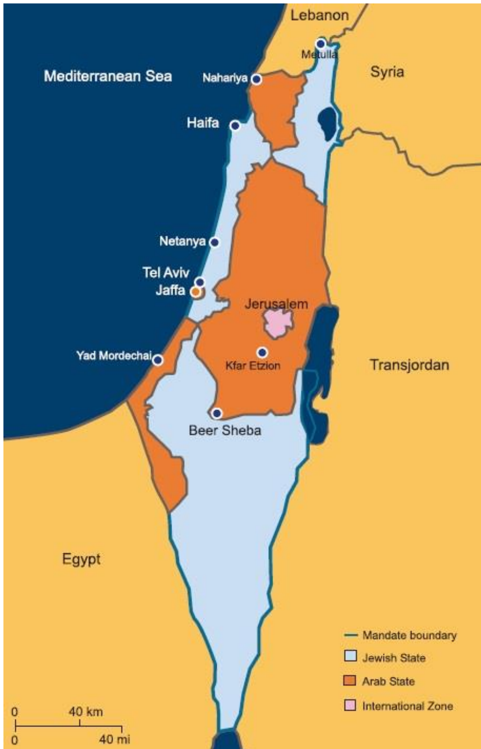
Map 2: The Partition Plan (1947)