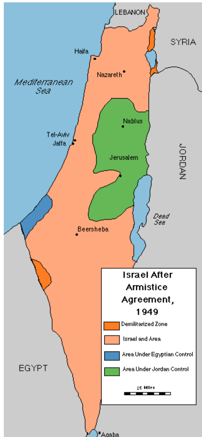
Map 3: Israel after the 1949 Armistice Agreement