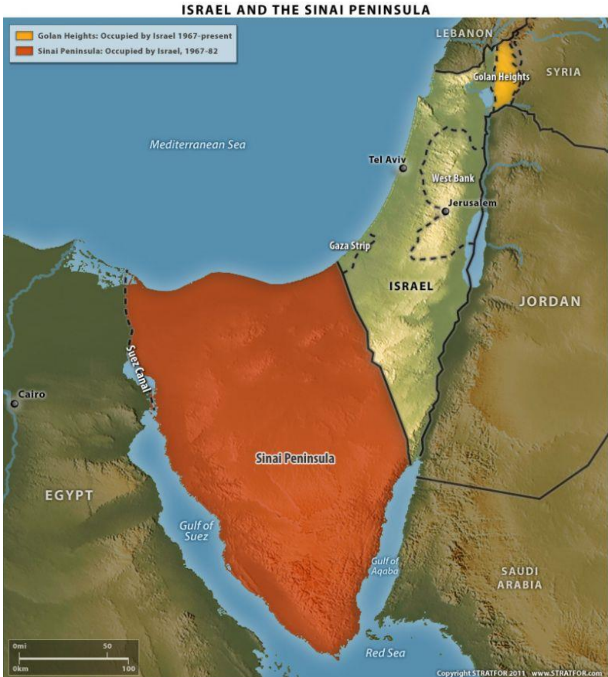
Map 5: Israel after the peace treaty with Egypt (1982)