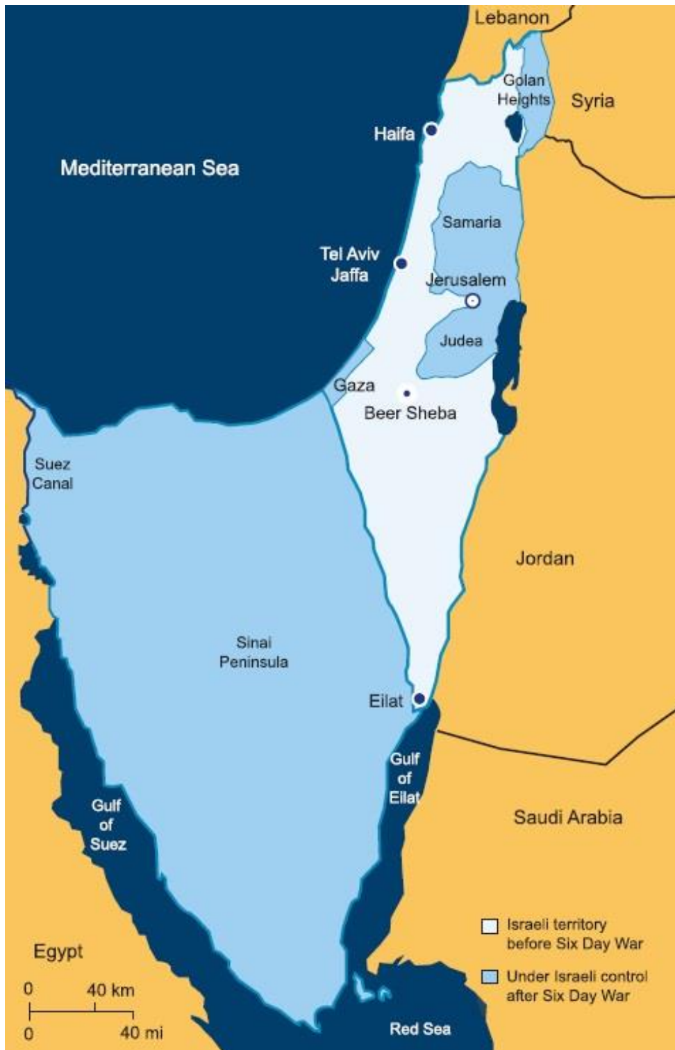
Map 4: Israel after the Six-day War (June 10, 1967)